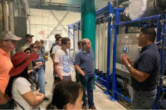
A tour of the award-winning Montevina Water Treatment Plant.