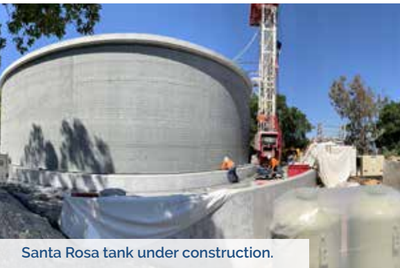
Santa Rosa tank under construction.