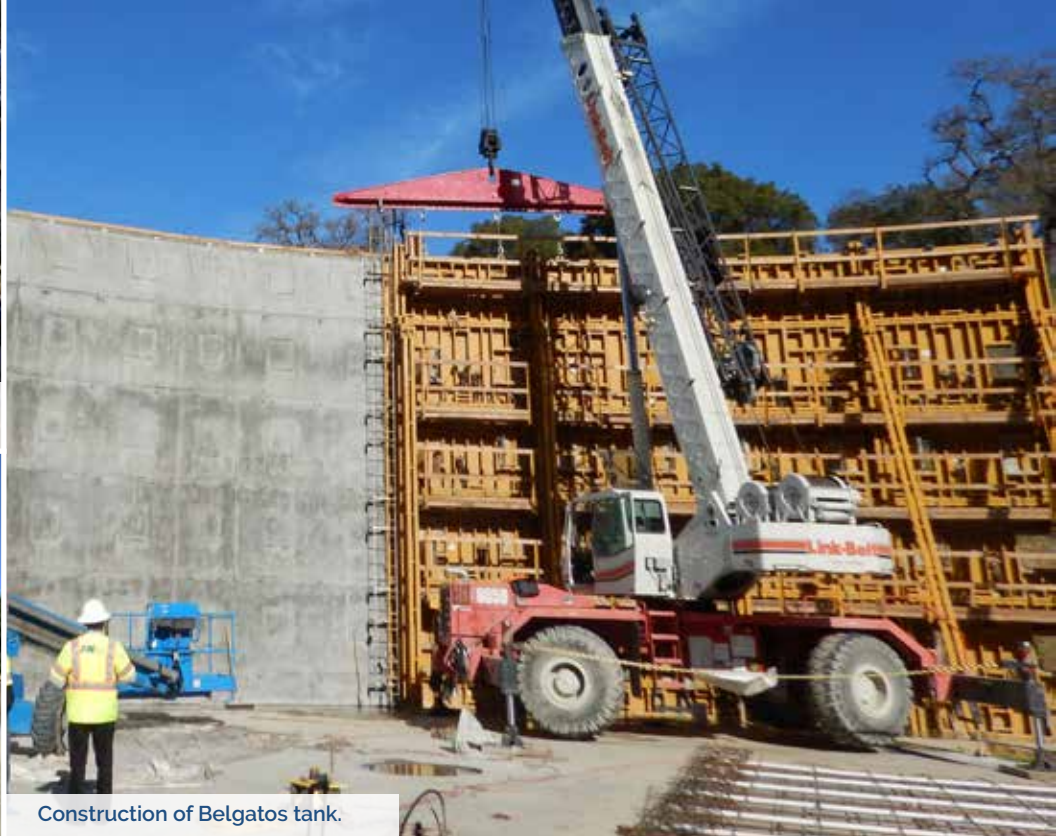
Construction of Belgatos tank.